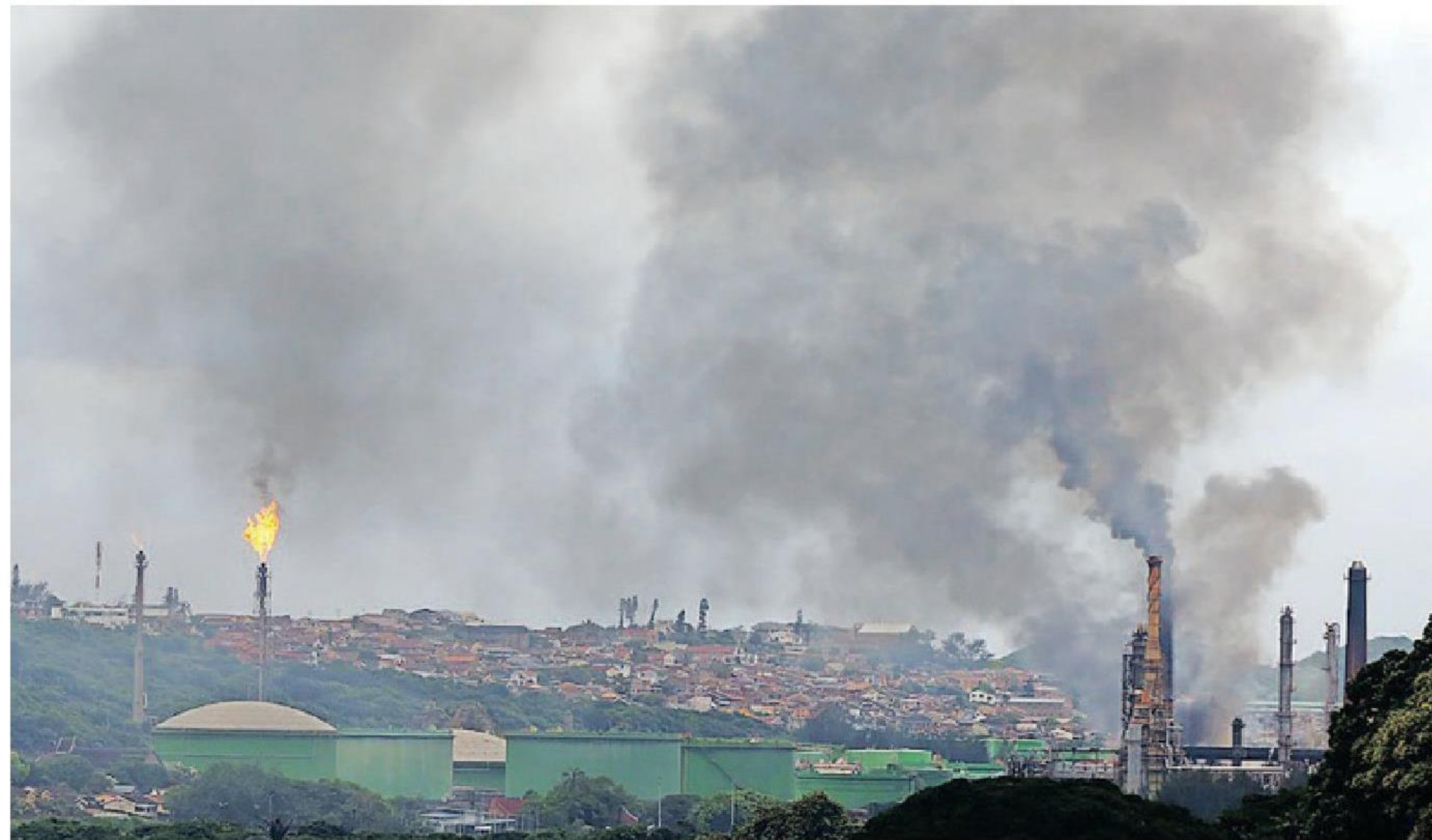
THE massive explosion at the Engen Oil Refinery south of Durban earlier this month was a culmination of a history of abuse of the environment and the people who live nearby, says the writer.

These policies are all now manifesting themselves in climate change